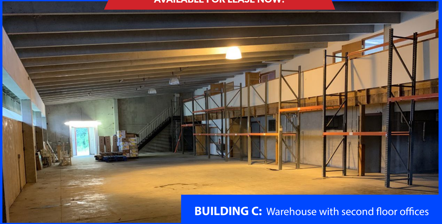
BUILDING C: Warehouse with second floor offices