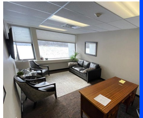
BUILDING B: Office / Church with Warehouse