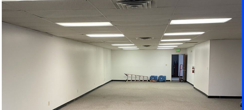
BUILDING A: Warehouse with Offices